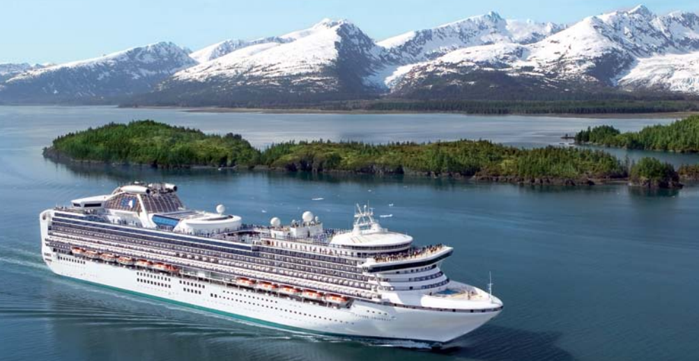
The Sapphire Princess® sailing the waters of College Fjord, Alaska.

Princess Cruises prides itself in delivering a consistent product and service experience to every passenger across their fleet. The service of Consummate Host® ensures a crew focused on delivering warm, welcoming, consistent service, and great tasting food, freshly prepared.